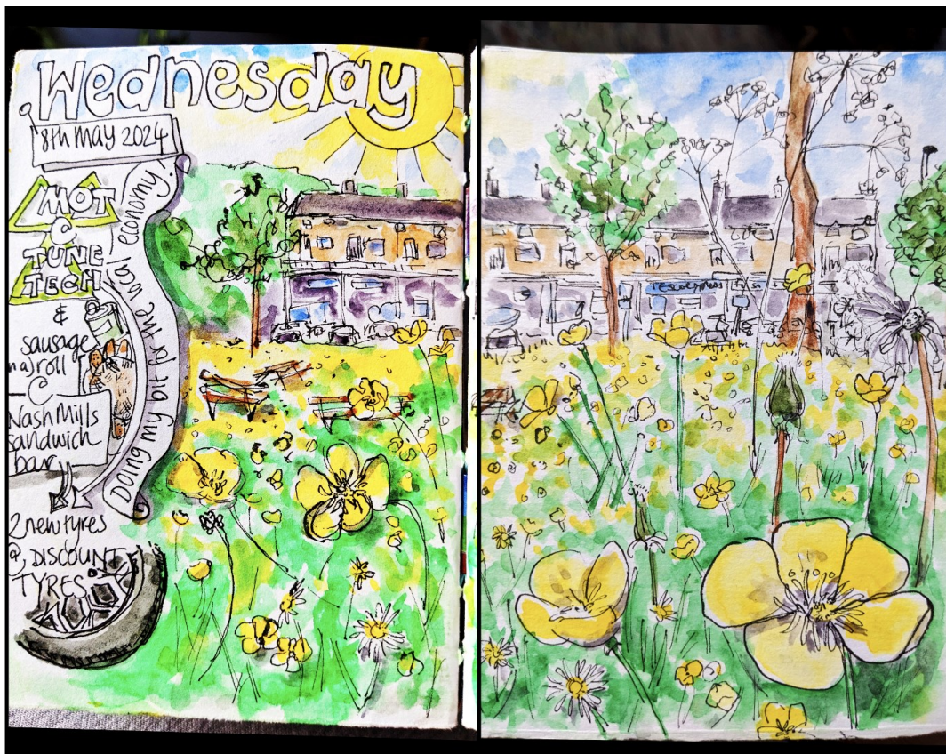
Illustration of The Denes with buttercups in the foreground